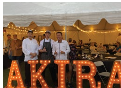
Concert On The Green – June 12, 2021