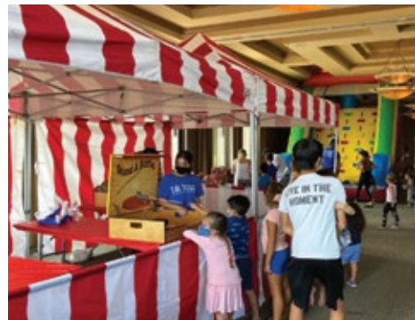
Family Fun Day – August 1, 2021