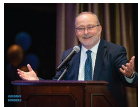
“Goldens Without Borders” Gala – August 19, 2021