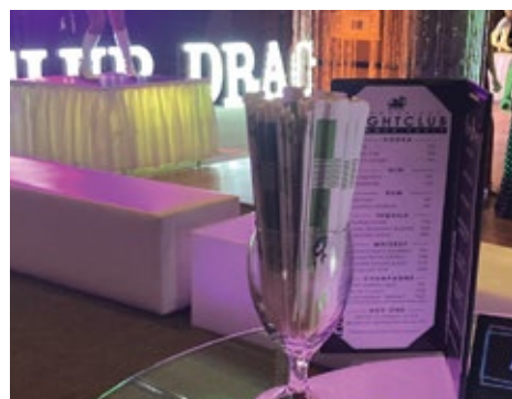
“Club Dragon” Nightclub Evening – August 26, 2021