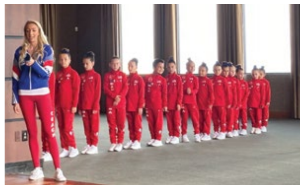
Elite Youth Competition – July 31, 2021