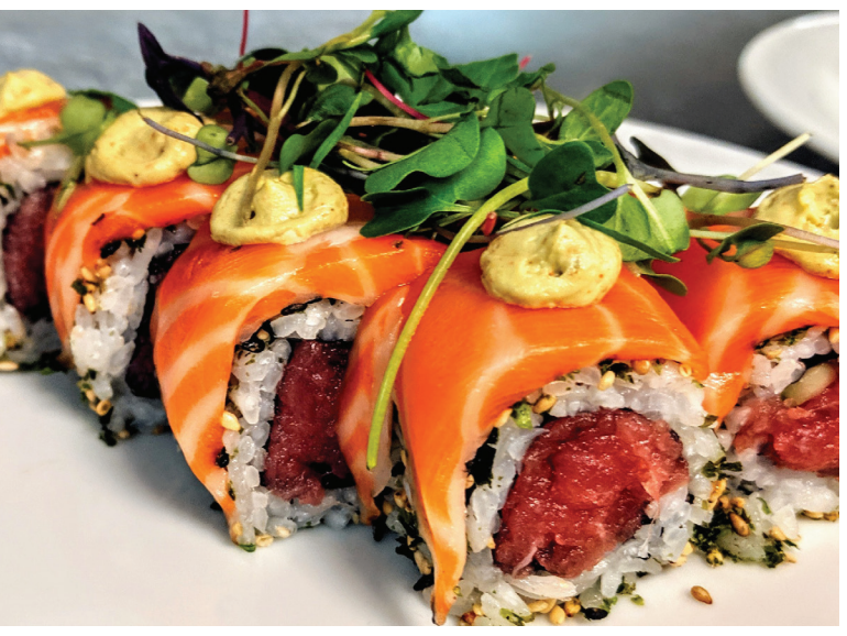
DragonRidge held Sushi and Sake night at the club Sept. 5.