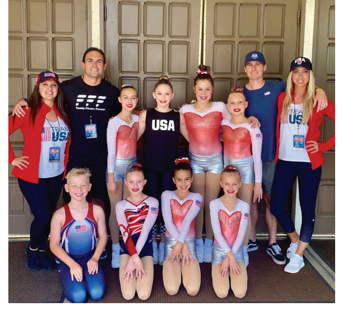
U.S. World Champion Aerobic Gymnastics Team trains at the DragonRidge Tennis and Athletic Center. The kids are looking for financial help to travel to competitions in several countries.

A We went to the World Championship of Aerobic Gymnastics, which was held in Phoenix, Arizona, and competed against 17 other countries in five different categories. We competed against the best teams in the world, and in all five categories we won!