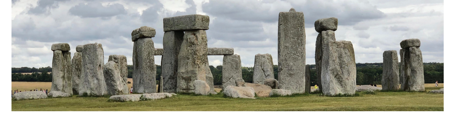
Stonehenge is one of the prehistoric wonders of the world

On Wednesday, we did a private tour of the Tower of London. Of course, we saw the crown jewels. The Imperial State Crown, which Queen Elizabeth II wore at her coronation, has 2,868 diamonds, 273 pearls, 17 sapphires, 11 emeralds and five rubies. The largest diamond is 317 carats. There is a 170-carat ruby and a 104-carat sapphire. One sceptre has a 530-carat diamond, which is the largest clear-cut diamond in the world. There were several other crowns, bejeweled swords, jewelry and other gold items.