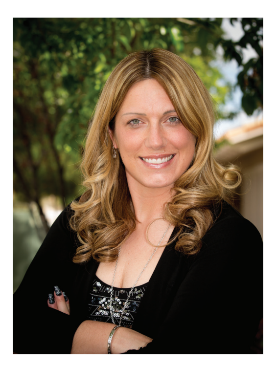
A message from the management: HOALETTER