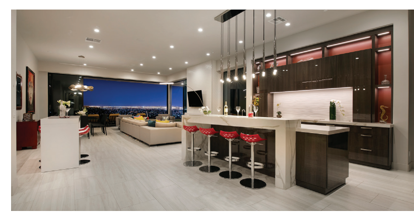
VU 2 | Modern Christopher Homes One Story with Strip Views 435 Serenity Point Dr. | Henderson, NV | 89012 1 Story | 3129SF | 3 Bed | 4 Bath | 2 Car | $2,000,000

Nevada is a state without individual and corporate income taxes offering significant savings for residents.